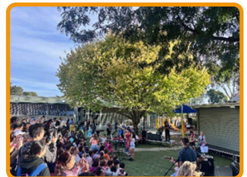
2025 Harmony Fiesta