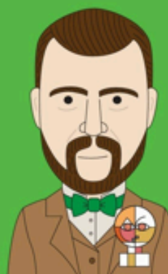
GERMAN PAINTER & PRINTMAKER