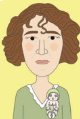
May Gibbs Illustration

CLARINDA PRIMARY SCHOOL ART SHOW Tuesday 14th October 5pm-7pm