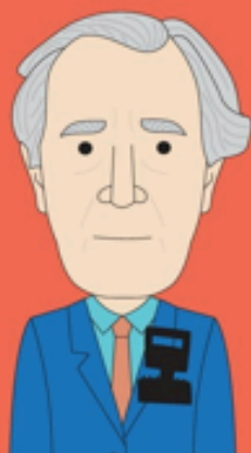
Sidney Nolan Modernism