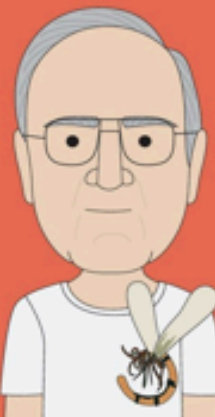
Pro Hart (CARTOONIST)