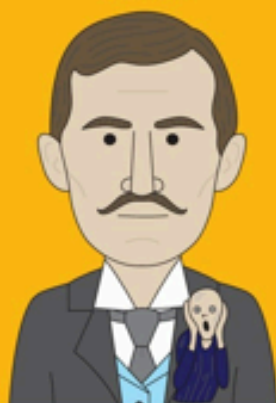
NORWEGIAN PAINTER & GRAPHIC ARTIST