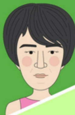
BRIDGET RILEY OP ART