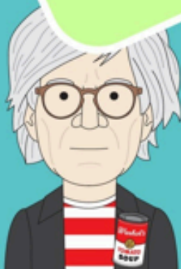
AMERICAN PAINTER, PRINTMAKER & PHOTOGRAPHER