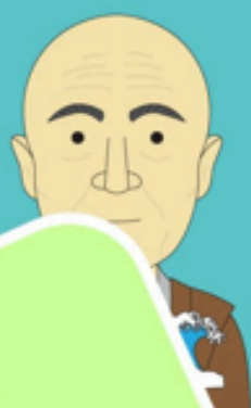
KATSUSHIKA HOKUSAI UKIYO-E